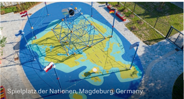
Spielplatz der Nationen, Magdeburg, Germany