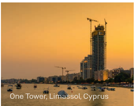
One Tower, Limassol, Cyprus