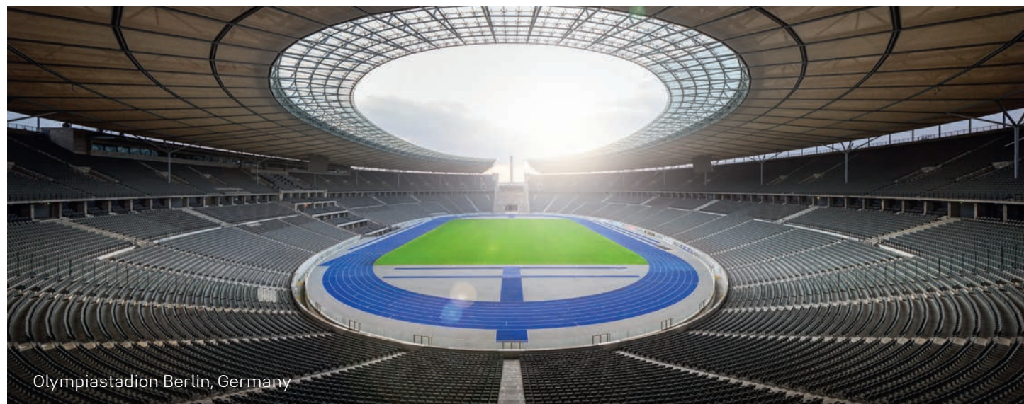
Olympiastadion Berlin, Germany