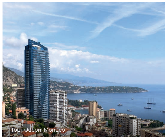
Tour Odeon, Monaco