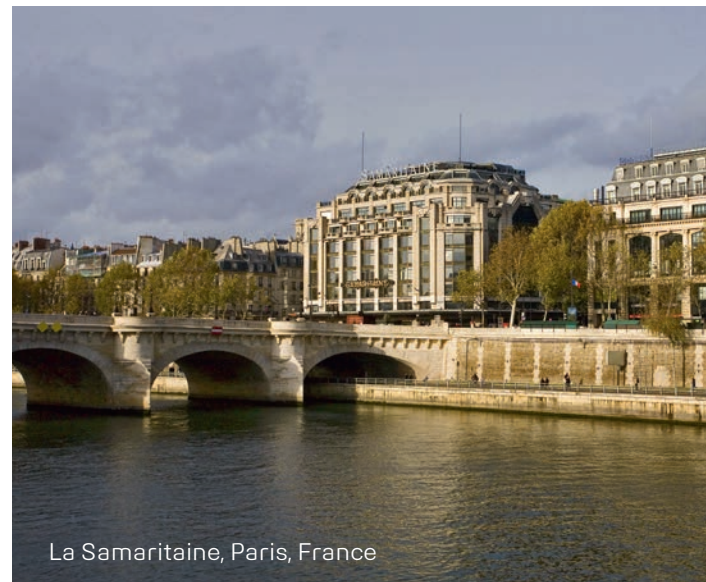
La Samaritaine, Paris, France