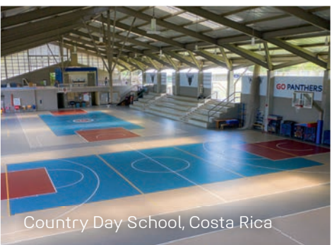
Country Day School, Costa Rica