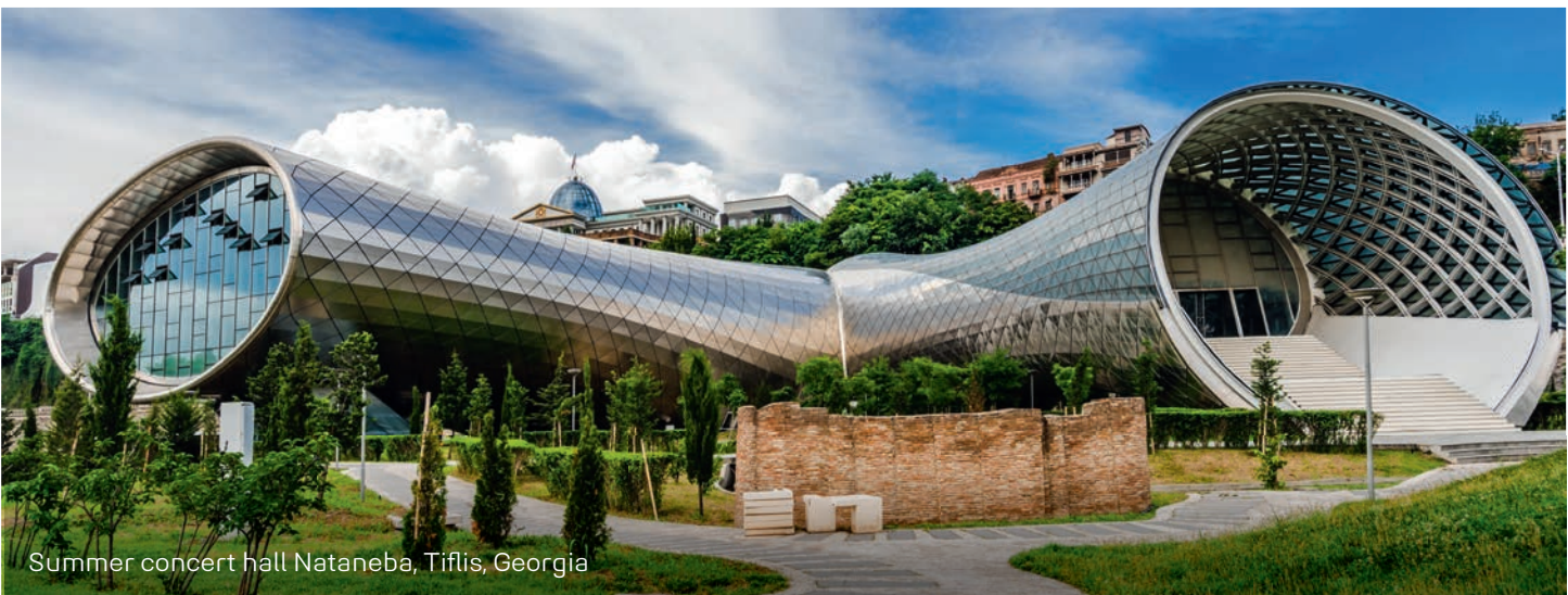
Summer concert hall Nataneba, Tiflis, Georgia