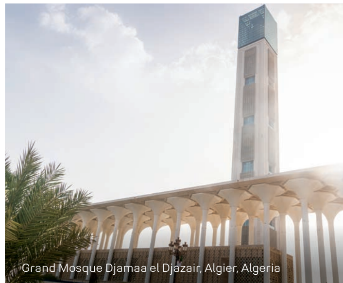
Grand Mosque Djamaa el Djazair, Algier, Algeria