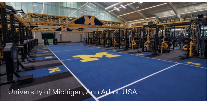
University of Michigan, Ann Arbor, USA